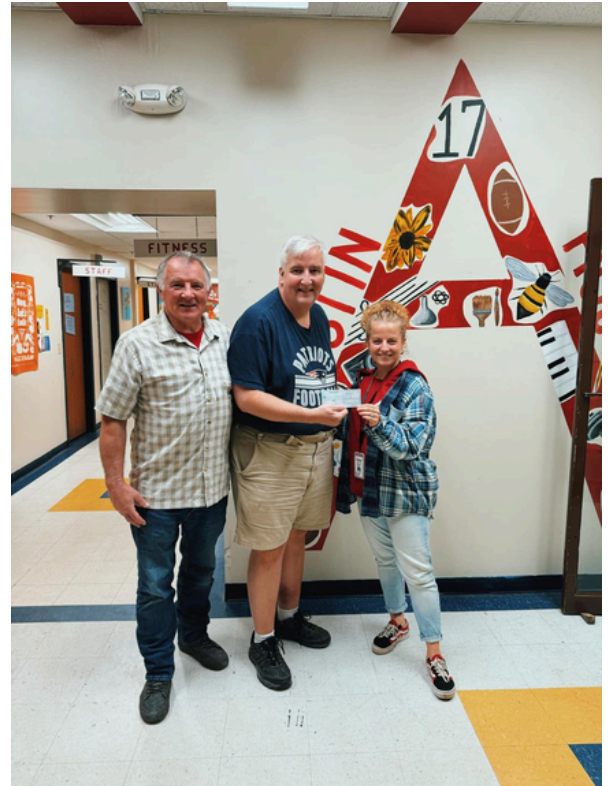
Thank you, Lions Club of Sandown, for your donation!

One of our most impactful initiatives has been the establishment of our Family Scholarship Fund. This fund is designed to address the social determinants of health associated with addiction, mental illness, or lack of support and resources. Through this fund, we have provided essential services such as transportation, gas and grocery cards, utility assistance for families in need during the winter months, group exercise classes, and other various expenses that come up in life. In 2023, our Family Scholarship Fund supported over 40 youth and families and has continued to grow this year to over 50 families.