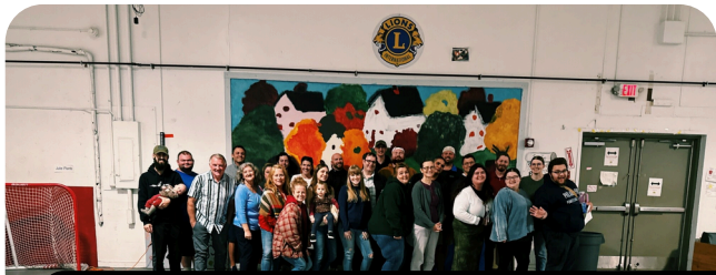
Staff at A17H Quarterly Family Staff Meeting