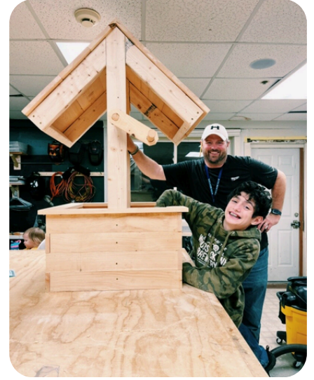
Pictured: Youth & Shop Mentor during Shop Class