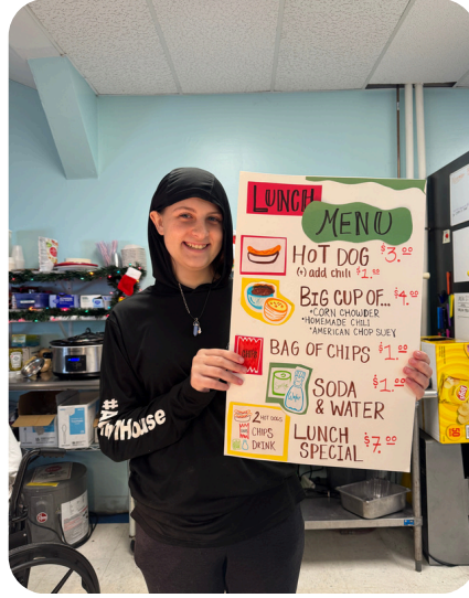
Pictured: Youth selling food at one of our A17H events