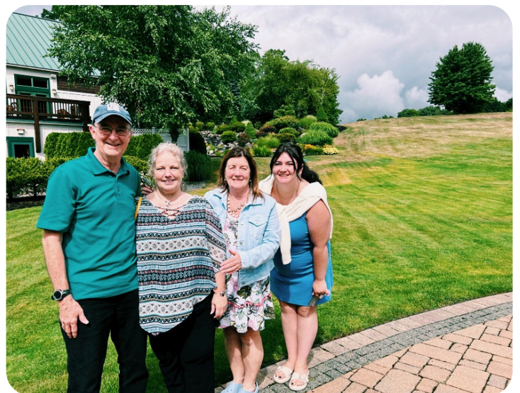
Staff helping at 2024 Annual Golf Gala